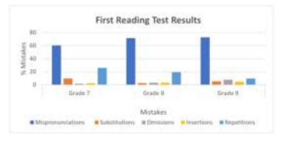
Figure 1. Shows the results before the students used ORVT

The provided data showcases the distribution of errors made by students three different classes across in pronunciation, substitution, omission, insertion, and repetition, before utilizing ORVT (Orthographic Vocalic Rhythmic Training). The analysis reveals that the majority of errors in mispronunciation were prevalent in Grade 7 with 60.34%, followed by Grade 8 with 71.39%, and Grade 9 with 72.82%. In terms of substitution errors, Grade 7 accounted for 9.7%, Grade 8 for 2.72%, and Grade 9 for 5.24%. Omission errors were observed at a rate of 1.69% for Grade 7, 3.27% for Grade 8, and 7.73% for Grade 9. Insertion errors were distributed with 2.53% in Grade 7, 3.27% in Grade 8, and 4.49% in Grade 9. Lastly, repetition errors were noted as 25.74% in Grade 7, 19.35% in Grade 8, and 9.73% in Grade 9. These findings provide insights into the specific areas where students encountered challenges before undergoing ORVT, across the different grade levels.