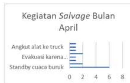
Figure 4. April Salvage Activity Recap

Based on information, salvor diving has an estimated road preparation to be completed within seven days and rescue operations including the installation of a wreck removal system in about 25 days. This implementation was carried out by a salvor Three Diving diving crew of 23 people, 4 people from Navi and local residents for security and road construction from the main to the beach location. This note also added that the weather conditions in the incident area were waves of about 1.5 meters to the southwest, gentle wind, cloudy and good visibility.