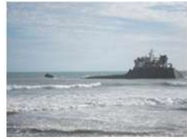
Figure 3. Gabon-flagged ship at the scene

The condition of the Gabon-flagged ship when the removal of the ship's skeleton in the waters of Nias, North Sumatra, will be carried out. In accordance with the conditions of the field, scraping salvage is carried out, there is an exclusive ecosystem zone so that incidents do not occur that make the condition worse, the surveyor and marine consultant must consider many things and conditions far from the mainland, additional equipment is needed to get to the scene of the incident.