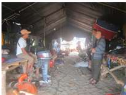
Figure 2. Internal Meetings in the Wreck Area

The meeting between the surveyor and the marine consultant on how the equipment and techniques that had previously been agreed on were in accordance with the conditions in the field. Preparation of peeling and goods as needed with salvage techniques that have been planned, in conditions is scraping salvage . These activities must also pay attention to environmental conditions so that they do not further damage/pollute the ecosystem.