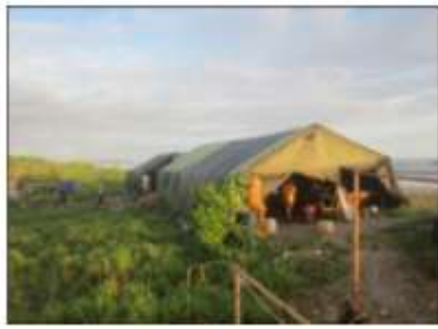
Figure 1. Heavy equipment mobility basecamp