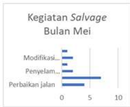
Figure 5. Recap of May Salvage Activities

From figures 4 and 5, it is found that the activities that are often carried out are road and bridge repairs for the mobility of salvage equipment, good road access is needed so that vehicles can reach the scene of the incident. This activity takes at least up to seven days, of course this is one of the inhibiting factors in cargo and wreck rescue activities. In addition, erratic weather conditions also result in other activities not being able to run, the effect of the erratic weather is strong winds and large sea waves. It can be said that from April to May it is still raining weather, from the records of the results of the activity it is also seen that the sea wave conditions of Nias waters can be seen: