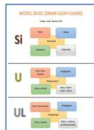
Picture 1. SIUUL model

The data analysis technique in this study is the data that has been neatly collected is coded to make it easier to group or identify. The respective coding is 1). Observation Notes, 2). Abbreviated Interview Notes, 3). Documentation Records. This research was carried out at Panca Sakti University Bekasi in 2022.