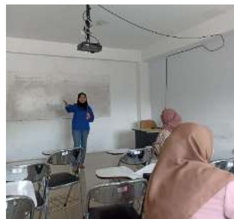
Picture 3. Implemantation Activity Ucap