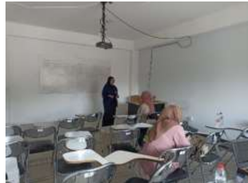
Picture 2. Implemantation Activity Simak

at each other when asked to practice but when we apply the SIUUL method it is almost invisible anymore, students with confidence to appear to bring their English speech.