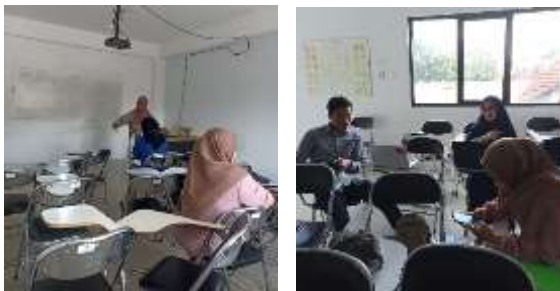
Picture 4. Implemantaiion Activity Ulang

Entering the second session, the instructor with the participants training conducts discussions. The participants were awarded time to give questions about things which is not yet understood. In the third session, the Instructor practiced how to deliver a speech that is engaging and can impress the audience. Some trainees strive to put the concept into practice speeches and English-speaking MCs who have them Prepare before training. After giving training and guidance to make speeches, some students were asked for comment.