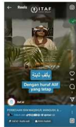
Figure 1. Sc. Instagram @itaf.id

This feature is a collection of all photos and videos uploaded on Instagram accounts that are used for permanent learning materials (Rembulan et al., 2020). In this feature, the @itaf.id account utilizes this feature by uploading content about the Arabic language which is designed as interesting as possible, in addition account owners can add captions to each upload according to the message they want to convey. The @itaf.id account makes the most of this feature on Instagram, uploading photos and videos of material that is permanent and accessible to other users. For an example of its application can be seen in the picture below.