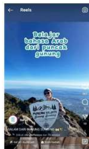
Figure 2. Sc. Instagram @itaf.id

The materials displayed in the picture above cover the three main skills in language learning, namely listening, reading and speaking skills. The followers of the @itaf.id Instagram account can read each material presented clearly and understand the content more deeply.